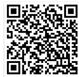
SUP Map QR Code

Why? ROR21-SUP offers opportunities for bicyclists of all ages and abilities to be outside riding bicycles and introduces them to our remarkable Shared Use Pathways in the Kalamazoo area.