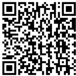
More Info QR CODE

Where? The map for ROR21-SUP (below and in Google MyMaps - use the “SUP Map” QR Code below) guides cyclists along all Shared Use Pathways in Kalamazoo County. Suggested routes, of different lengths, across the county are available on the Kalamazoo Bicycle Club website at the ROR21-SUP page. The “More Info” QR Code below will also take you to that page.